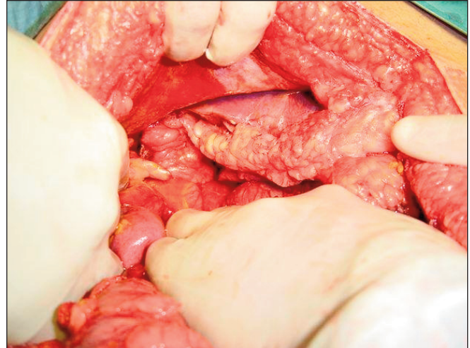
Fig. 2. A perioperative photograph showing hemostasis achieved by application of a pedicled falciform ligament flap to the raw hepatic surface and compressed for 10 minutes.

absence of modern hemostatic agents such as surgical, gelfoam or fibrin glue. 3