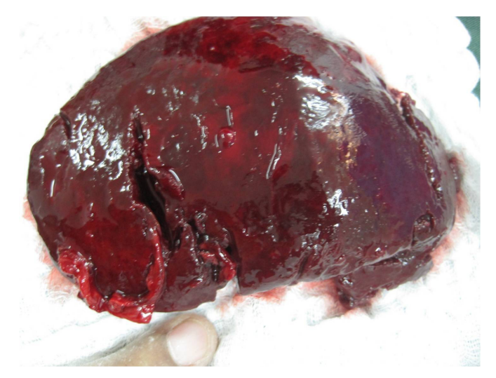
Figure 2: Ruptured spleen after removal