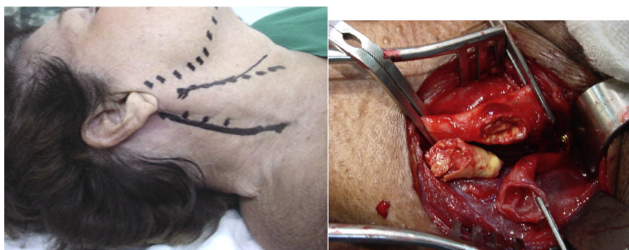
Fig. 5 – Cervical plexus block for eversion carotid endarterectomy.