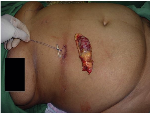
Fig. 3 – Mini lap cholecystectomy for acute cholecystitis.

as laparoscopic equipment is available in Public Hospitals in only five of the 19 Caribbean territories.