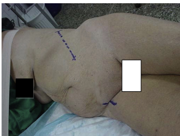
Fig. 6 – Patient position for retroperitoneal aortic surgery. Incision along dotted line.

have our Residents do the American Board of Surgeons in Training Examination (ABSITE). Dealing with our unique challenges requires innovative solutions and we actively and continually pursue these as our internet-savvy people expect first-world results while we grapple with third-world facilities and low-volume work. Nevertheless, we must actively and continually pursue the goals of the delivering excellent care in spite of our circumstances.