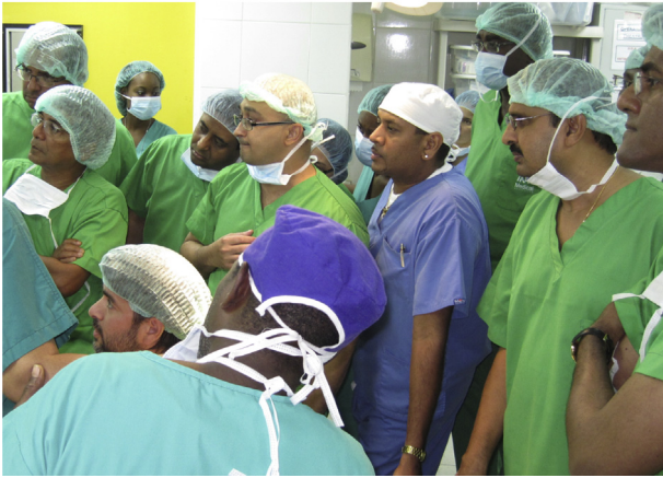
Fig. 2 – Local surgeons observing a foreign expert at a workshop in Trinidad.