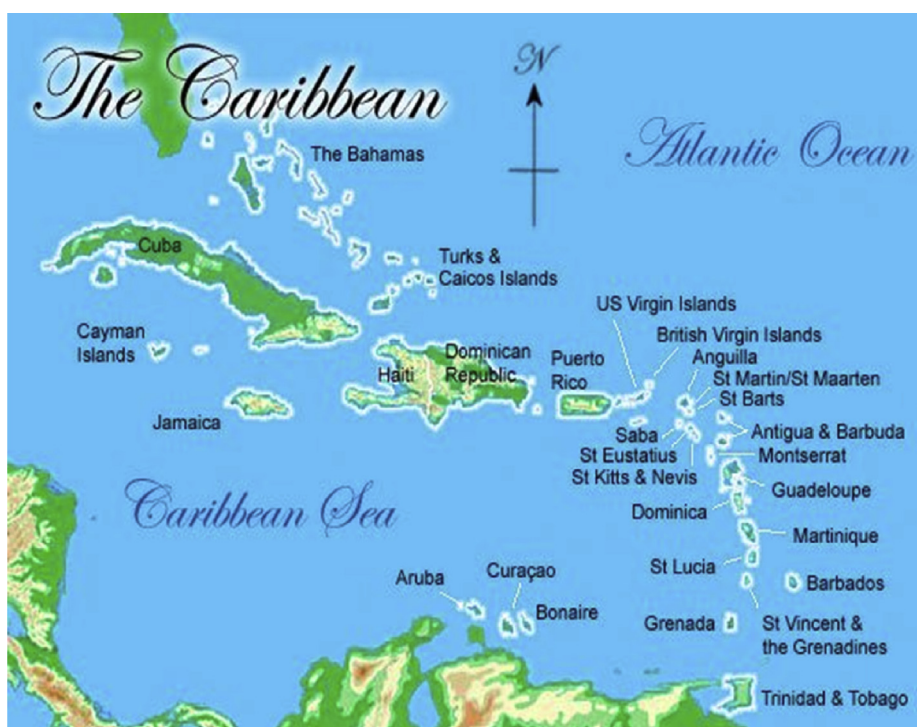
Fig. 1 – Map showing the West Indian territories.

In addition to importing expertise, we also have to develop creative ways to work with limited resources while attempting to achieve acceptable results. 6 For example, the surge in minimal access surgery emphasises the advantages of early mobilisation, minimal scarring, decreased pain and early return to work. However there are limitations that seriously challenge the widespread implementation minimally invasive services in our resource-poor setting, such as the acquisition and maintenance of expensive equipment, high cost of disposable instruments, challenging learning curve, the need for a significant volume to maintain skills and increased operating time. In these circumstances, we have firmly established the value of mini laparotomy cholecystectomy that produces results similar to laparoscopic cholecystectomy, but requires no special equipment and instrumentation (Fig. 3). 7 This is extremely important for Caribbean surgeons