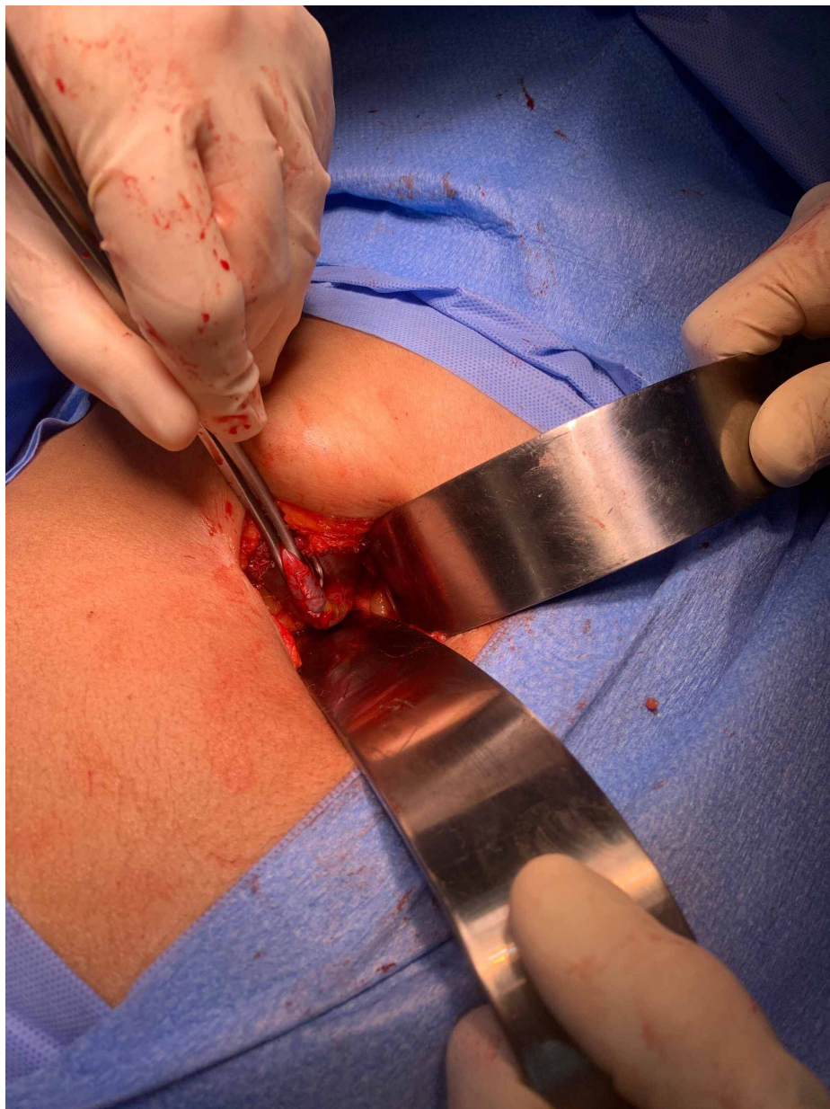
FIGURE 1: 5cm minilaparotomy cholecystectomy incision employing 2 narrow Deaver retractors

Narrow Deaver retractors were used to retract the liver cephalad and the duodenum and adjacent bowel away from the gall bladder (see figure 1). Dissection of the cystic artery and cystic duct were carried out using long conventional instruments. The cystic structures were ligated using 0-silk suture. The gall bladder was dissected, starting from Hartman's pouch advancing towards the fundus (Calot's First fashion) using electrocautery. A local anaesthetic infiltration of 10 mL of 0.25% bupivacaine was injected into the wound before closure in two layers with 0-nylon.