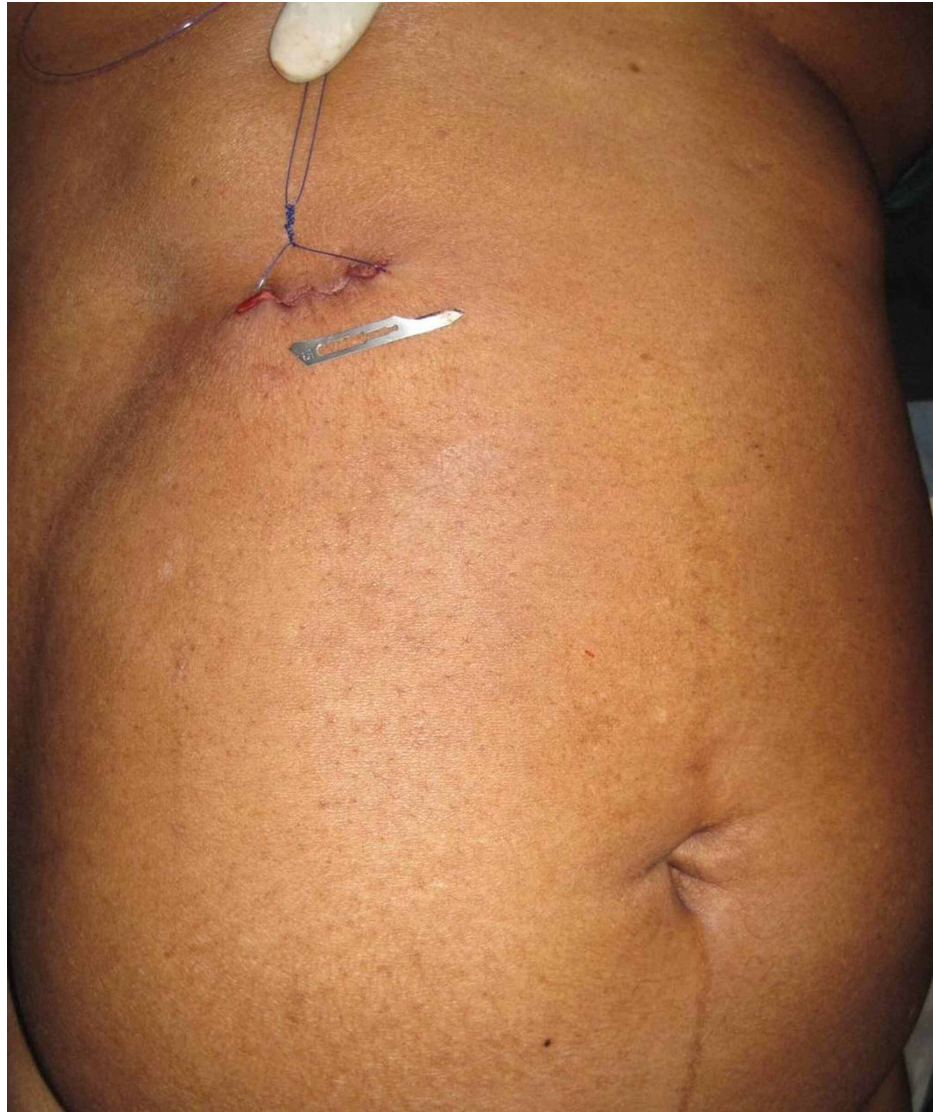
FIGURE 3: 4cm incision seen after closure of minilaparotomy cholecystectomy wound