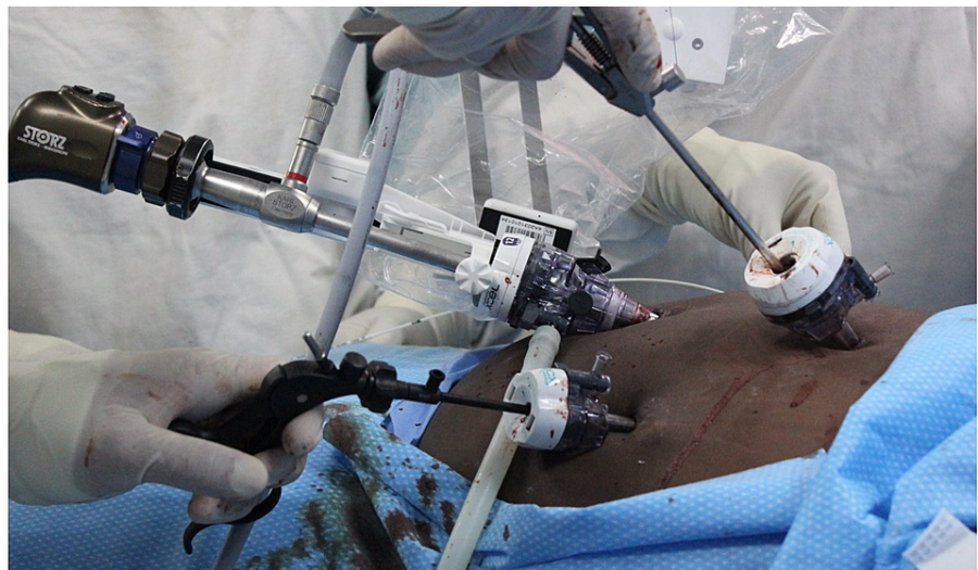
FIGURE 3: Detailed view of the operating field

The operating surgeon controls the robotic arm (white arrow) using head movements relayed by an infrared transmitter (yellow arrow) worn on a headband.