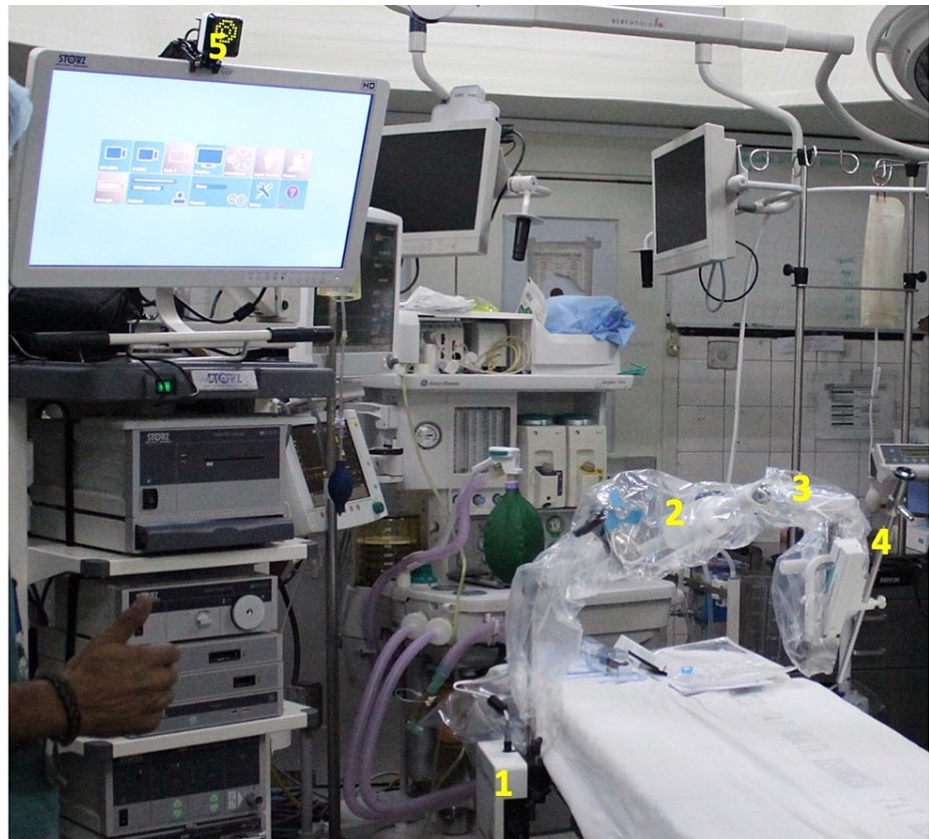
FIGURE 1: Placement of the Freehand® robotic arm

The Freehand® robotic arm was secured to the operating table and used to fixate a 10 mm zero-degree laparoscope that was introduced into the umbilical port (Figure 1). The Freehand® robotic arm was completely set up in approximately two minutes and did not consume a significant amount of operating time in this case.