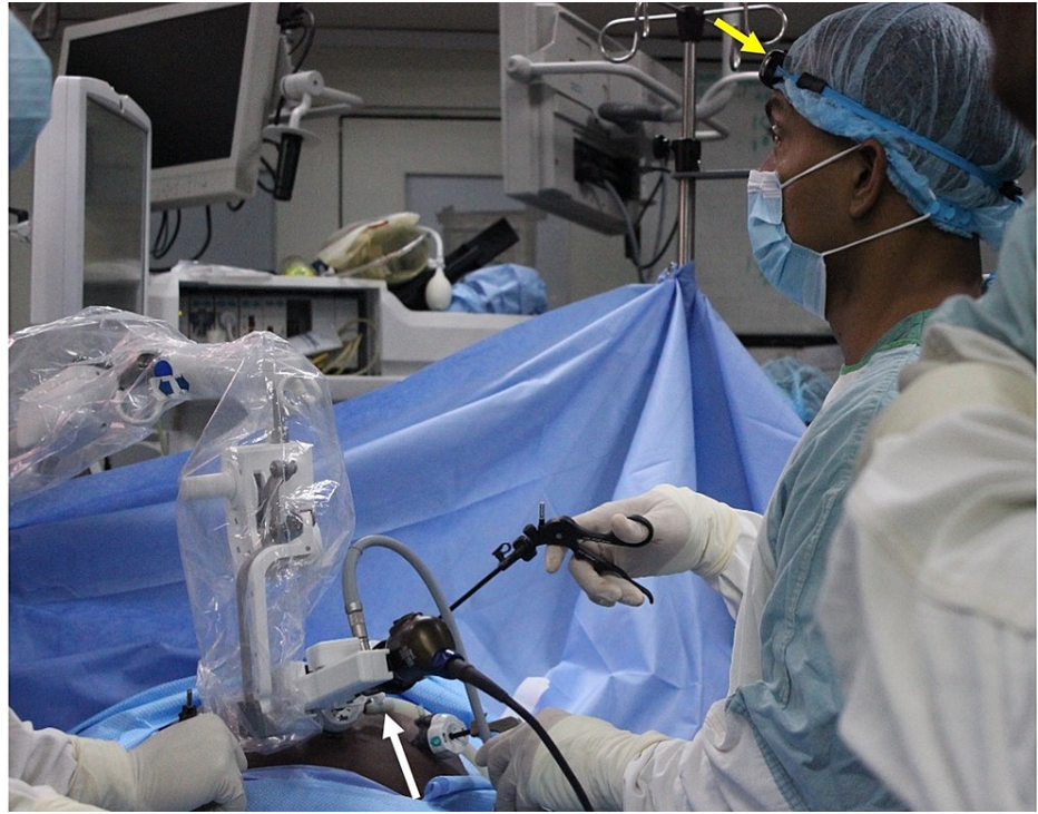
FIGURE 2: Intraoperative view of the robotic arm in use

The operating surgeon controls the robotic arm (white arrow) using head movements relayed by an infrared transmitter (yellow arrow) worn on a headband.